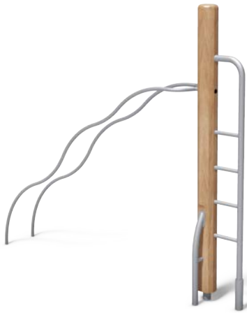
CLIMBY 1 302-001-002 302-001-004