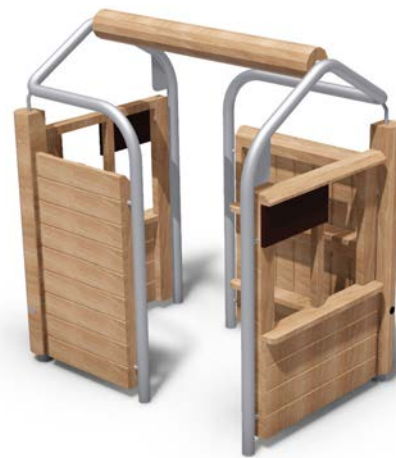
WALLY 5 306-005-002 306-005-004