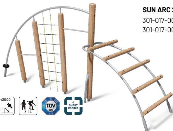
SUN ARC 2 301-017-002 301-017-004