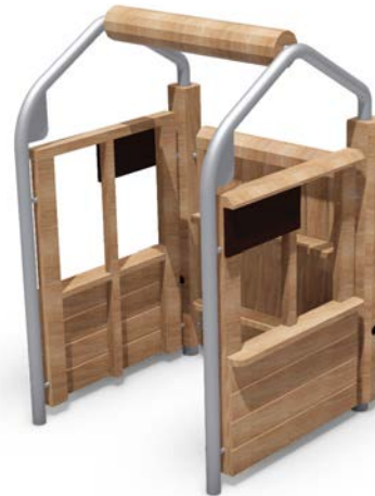
WALLY 6 306-006-002 306-006-004