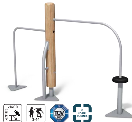
SAULTY-DUO 301-009-002 301-009-004