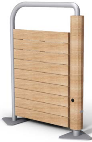
WALLY 1 306-001-002 306-001-004