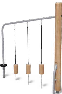
BLOCKSY 301-002-002 301-002-004