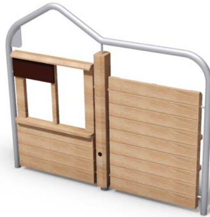
WALLY 4 306-004-002 306-004-004