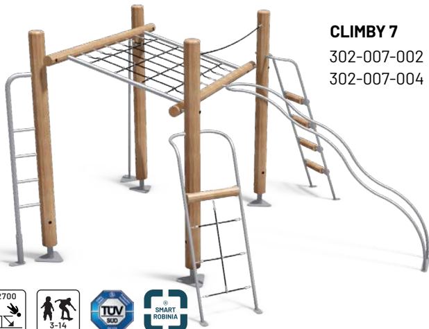
CLIMBY 7 302-007-002 302-007-004