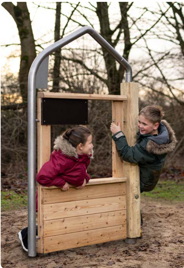
WALLY 2 306-003-002 306-003-004