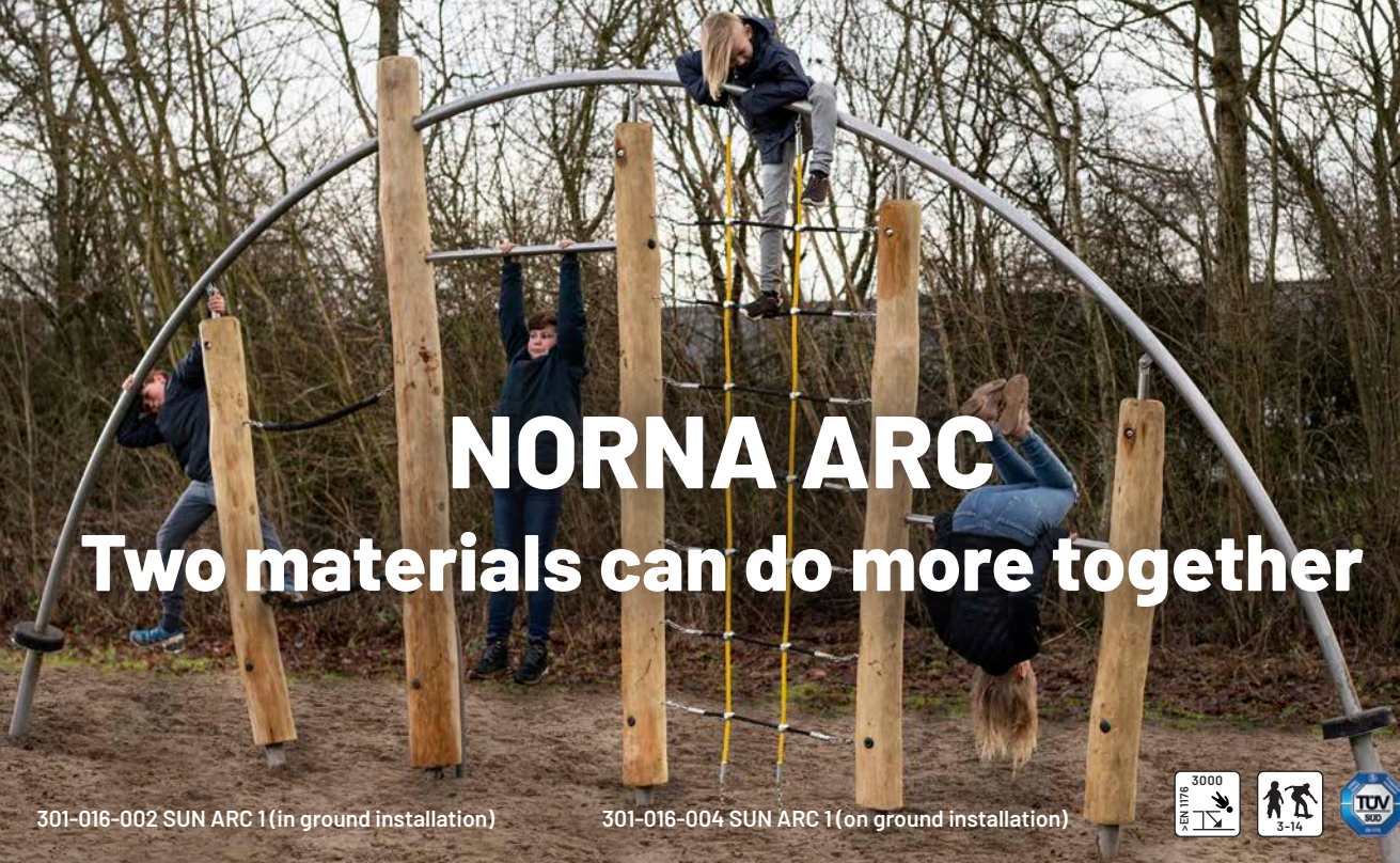
301-016-002 SUN ARC 1 (in ground installation)