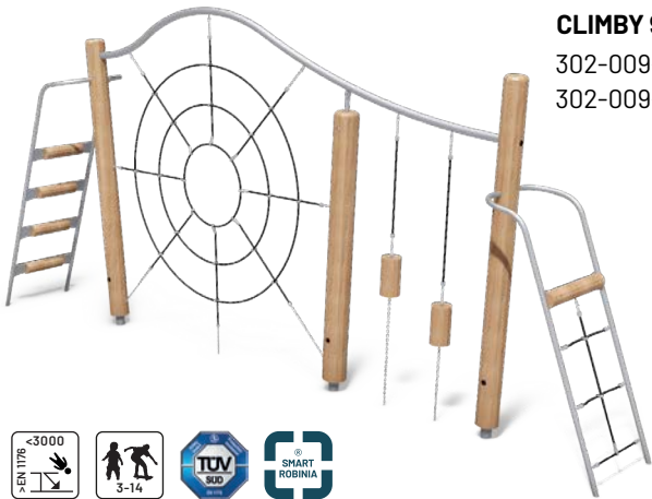
CLIMBY 9 302-009-002 302-009-004