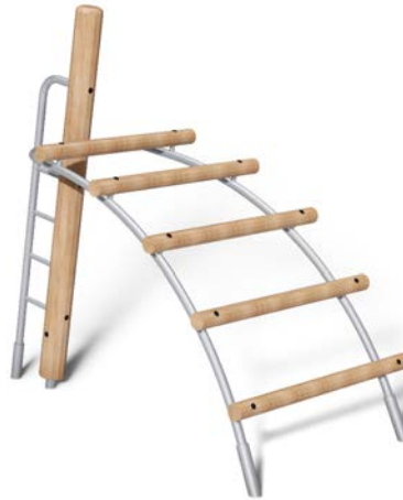
CLIMBY 2 302-002-002 302-002-004